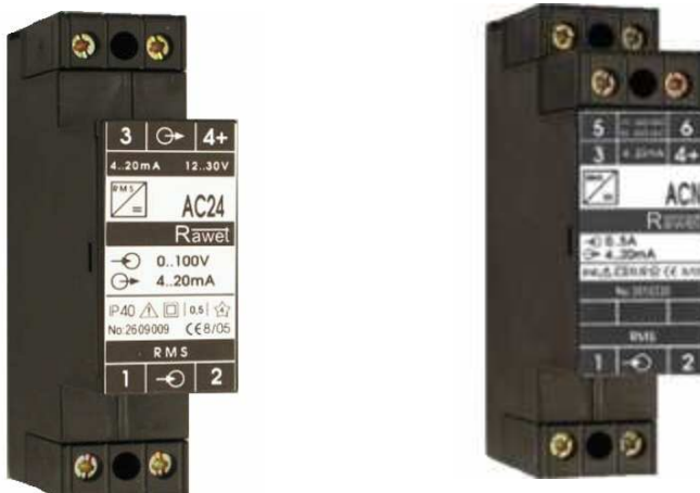
AC24, ACN - true RMS value

AC24, AC24/S - loop powered (passive output 4-20mA) ACN, ACN/S – wide range auxiliary power supply 19..300VDC and 90..250VAC (active output)